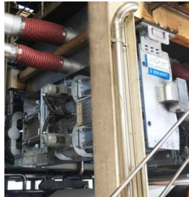
UniDryer® V3 made of two rows of Gem12E emitters followed by a set of 4 air bars